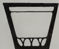
1½ oz. liquor